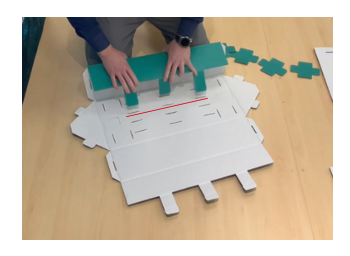
Step 1 Take the base section, folding one side and pulling the tabs through the second row of slots.

You'll receive base, front & back panel.