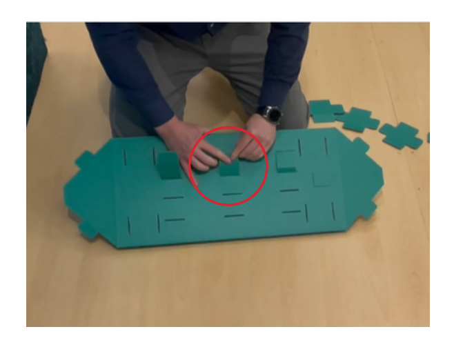
Step 2 Pull the entire tab through, then fold over and thread back through the slots closet to you. Complete process on both sides.