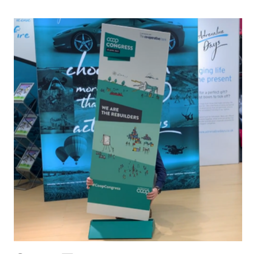
Step 7 Finally, place the constructed banner into the base.