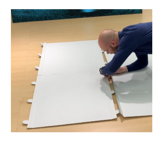
Step 5 Lay the front and back panel of the banner on the floor. Feed the tabs from one panel in to the slots on the side of the other.