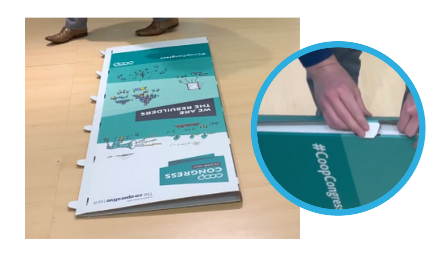
Step 6 Flip the banner over, so the print is now facing upwards. Connect the other side of the banner together using the tab and slot system.